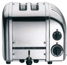
Sleek toaster Dualit Vario toaster. Approx. $220. At retailers across Canada.