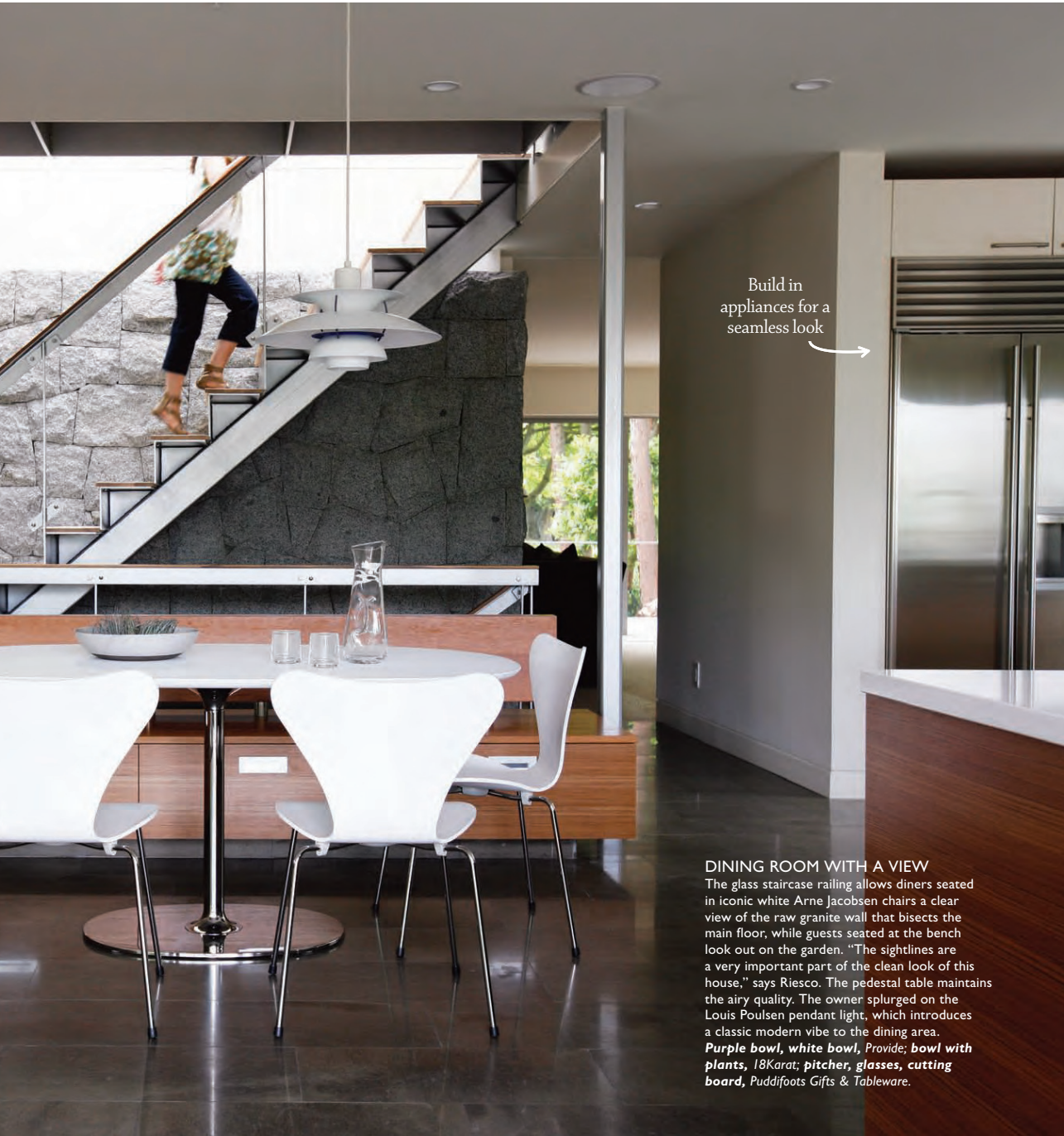
Build in appliances for a seamless look

DESIGN ELEMENTS Counters: Polished 1" Okite Cabinets: Painted white lacquer; teak slab Hardware: Stainless steel pulls Backsplash: White-painted glass Floors: 12" x 24" polished limestone tiles Sink: Undermount stainless steel basins with square corners Faucet: Modern chrome gooseneck with restaurant-style sprayer