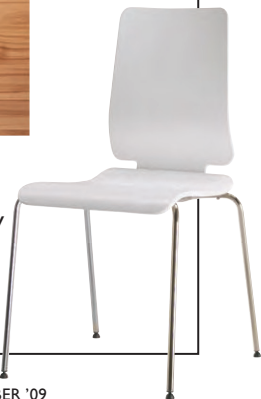
White contemporary chair Gilbert chair in painted birch veneer. $70. At Ikea.