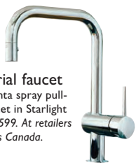
Industrial faucet Grohe Minta spray pull-down faucet in Starlight Chrome. $599. At retailers across Canada.