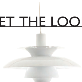
Glossy white pendant Pink and Brown Satellite pendant lamp. $260. At retailers across Canada.